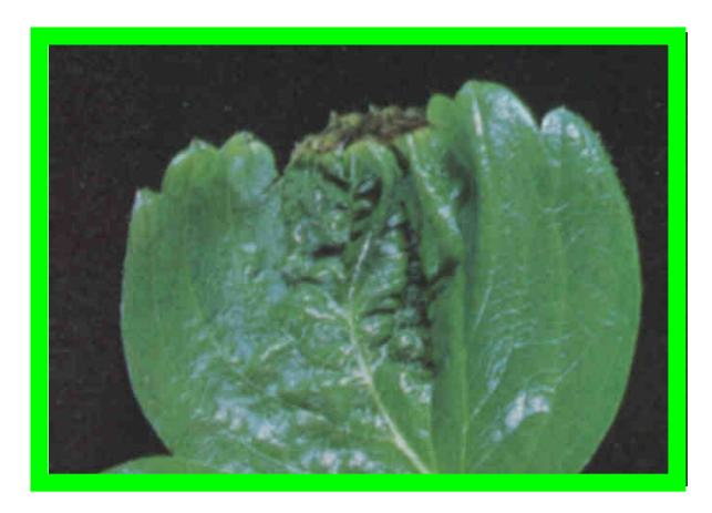
Tip burn and misshapen leaf due to calcium deficiency

The plant requires an adequate supply of calcium for all new growth of plant tissue. If calcium is short in supply new growth will be misshapen.